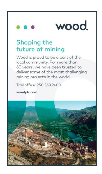
MINING: GOOD NEIGHBOUR AND PROVIDER TO THE WORLD WWW.CMEBC.COM