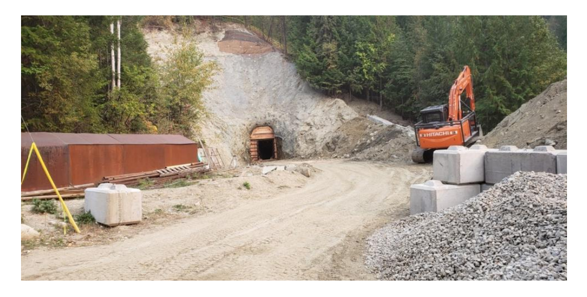
Photo of Kenville 257 Mine Level Portal and stockpile of crushed gravel for bedding (right).