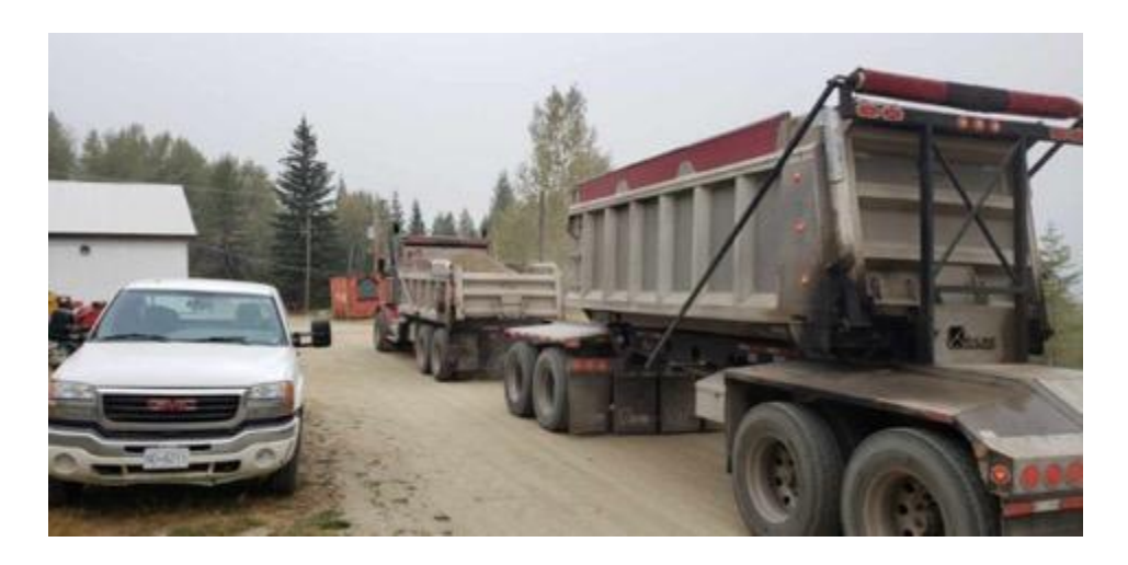
Photo of truck arriving at Kenville Mine carrying crushed gravel for culvert bedding

Work is now focused on laying bedding and placing the new steel culvert outside of the underground entrance (see photos below).