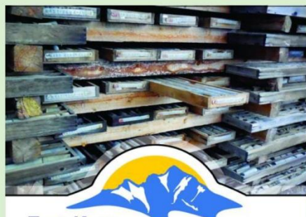
East Kootenay CHAMBER OF MINES